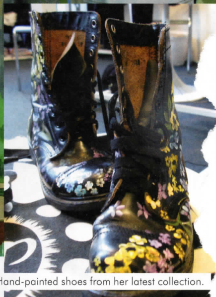
Hand-painted shoes from her latest collection.